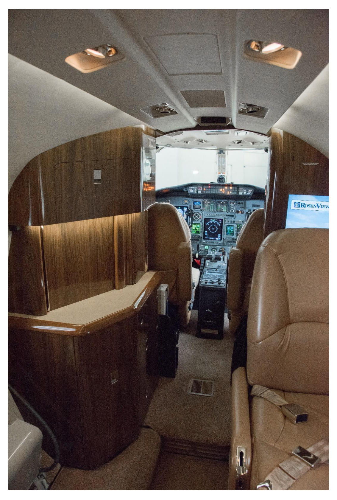
Aircraft offered subject to prior sale or withdrawal from market. Specifications subject to verification by Purchaser