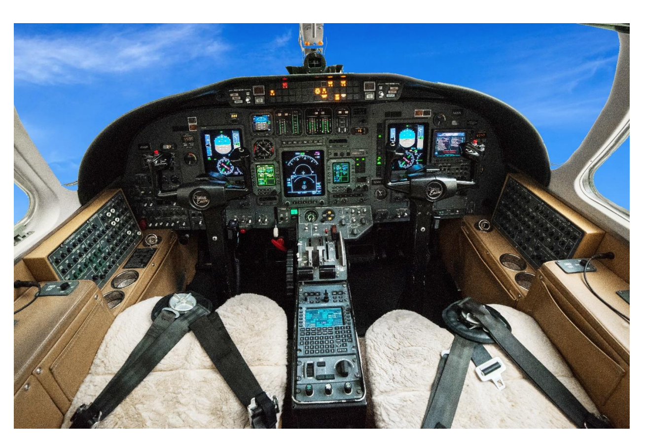
Aircraft offered subject to prior sale or withdrawal from market. Specifications subject to verification by Purchaser