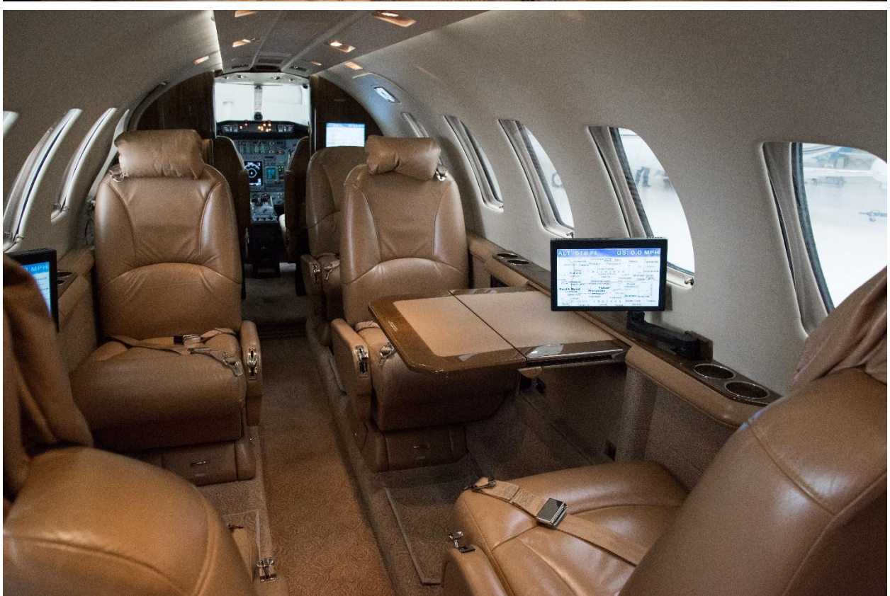
Aircraft offered subject to prior sale or withdrawal from market. Specifications subject to verification by Purchaser