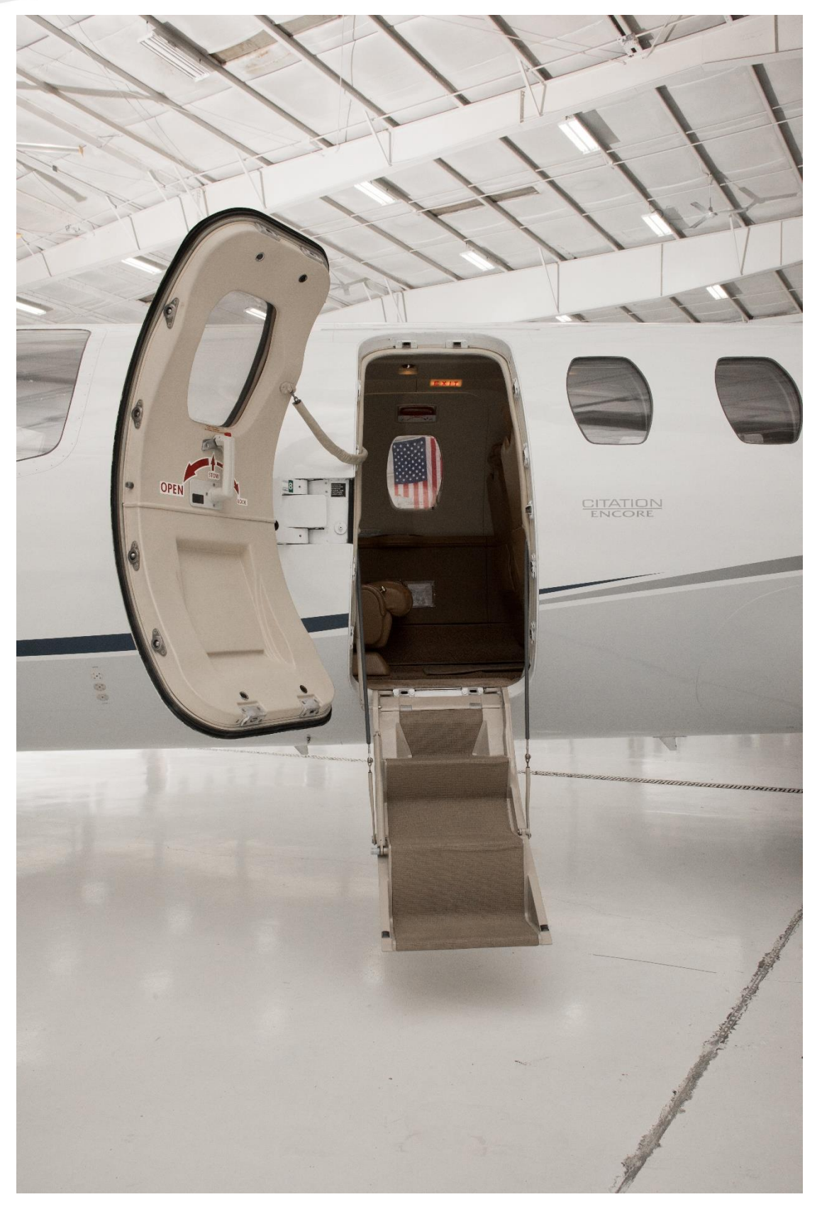
Aircraft offered subject to prior sale or withdrawal from market. Specifications subject to verification by Purchaser